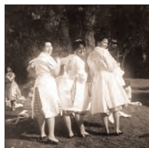
Figure 5. The photo of three nice female students in the gardens of the School of Chemistry.

After a session (in November) giving the floor to the French and Mexican witness of the participation of cooperants in