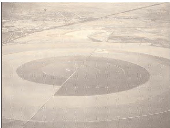
Figure 3. The “snail”. An enormous solar evaporator (its diameter is 3.4 km) constructed for the Texcoco-valley-subterranean-waters’ concentration of salts, in the industry “Sosa Texcoco”, founded in 1943.