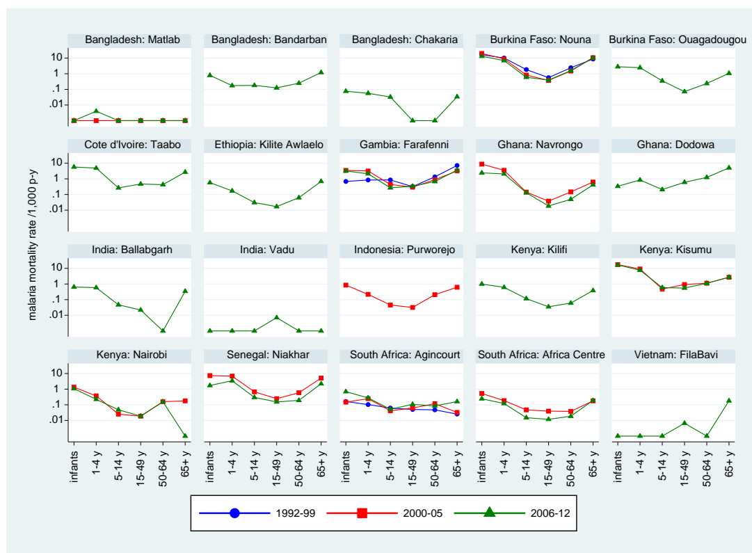
Fig. 2. Malaria mortality rates by site, age group and period at 20 INDEPTH Network sites.

years in 2010 (15). Since all the INDEPTH HDSSs cover defined small areas, it was possible to extract a PfPR value for each endemic site from the MAP data. Where sites covered more than one cell of the MAP surface, all the cells relating to the site were averaged. Data were available for 14 sites with childhood malaria mortality data; data were not available for seven sites in Vietnam, India, Bangladesh and Ethiopia, presumably because of very low or uncertain endemicity. Figure 4 shows the