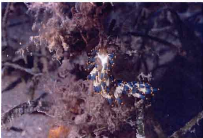
Cutoma kanga sp.