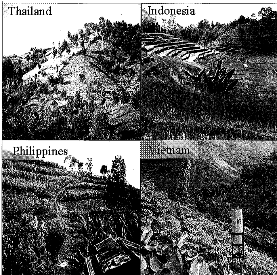
Figure 1. Landscape characteristics and land management in Indonesia (4 sub-catchments), Philippines (4 sub-catchments), Thailand (4 sub-catchments), and Vietnam (4 sub-catchments).

was automatically recorded at a time step lower than 10 minutes. In Laos, Thailand, and Indonesia, water samples were collected during the main rainfall events to assess the sediment concentration. The time interval for water sampling differed among sites. Samples were collected at time intervals from two minutes to one hour depending on water discharge peaks. Bedload sediments, i.e. the sediments trapped in the weirs, were collected and weighed after each main rainfall event or once at the end of the rainy season depending on the amount accumulated. Runoff and sediment yield data were computed to obtain yearly means. Mean annual suspended sediment concentration was combined with water flux data to assess the annual suspended load, using data interpolation between the sampling periods.