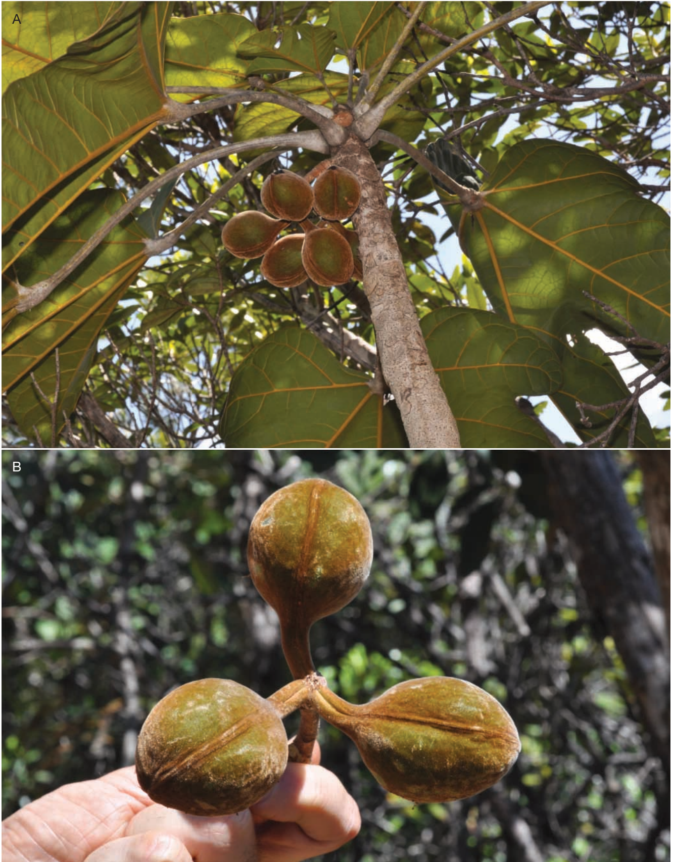
FIG. 3. — Acropogon moratianus Callm., Munzinger & Lowry, sp. nov.: A , Upper part of the monocaulous treelet; B , detail of follicles, Callmänder et al. 854.