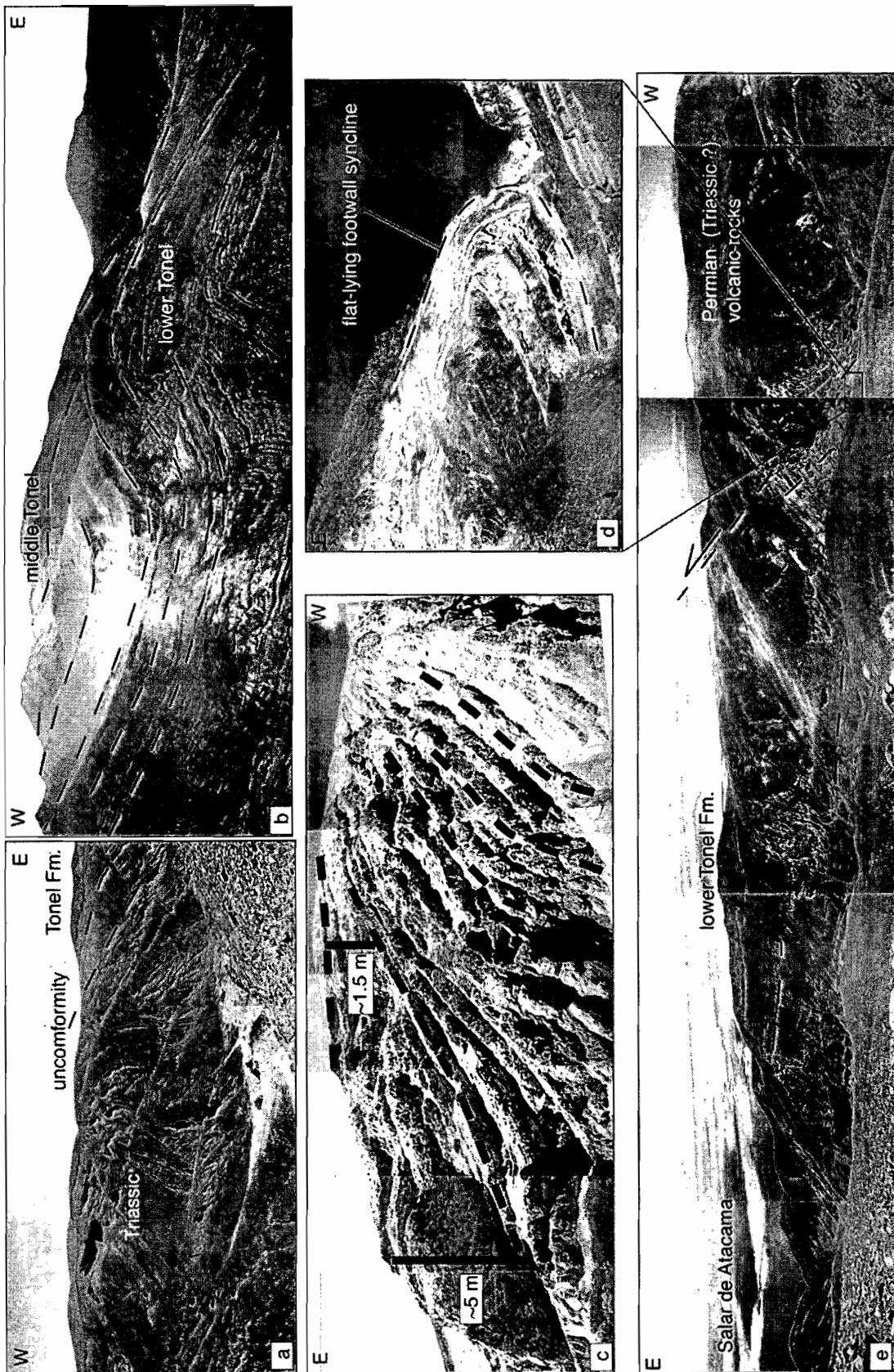
Figure 2: Structures at selected localities (see Fig. 1). a. Anticline overturned to E in Triassic and lower Tonel strata. b. Growth syncline in lower Tonel Fm. c. Growth strata in lower Tonel Fm. d. Footwall syncline in lower Tonel Fm (located in e). e. Thrust front at eastern edge of Cordillera de Domeyko.