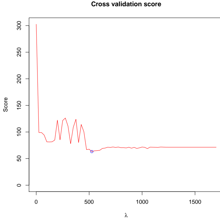
Figure 2: Score of cross validation