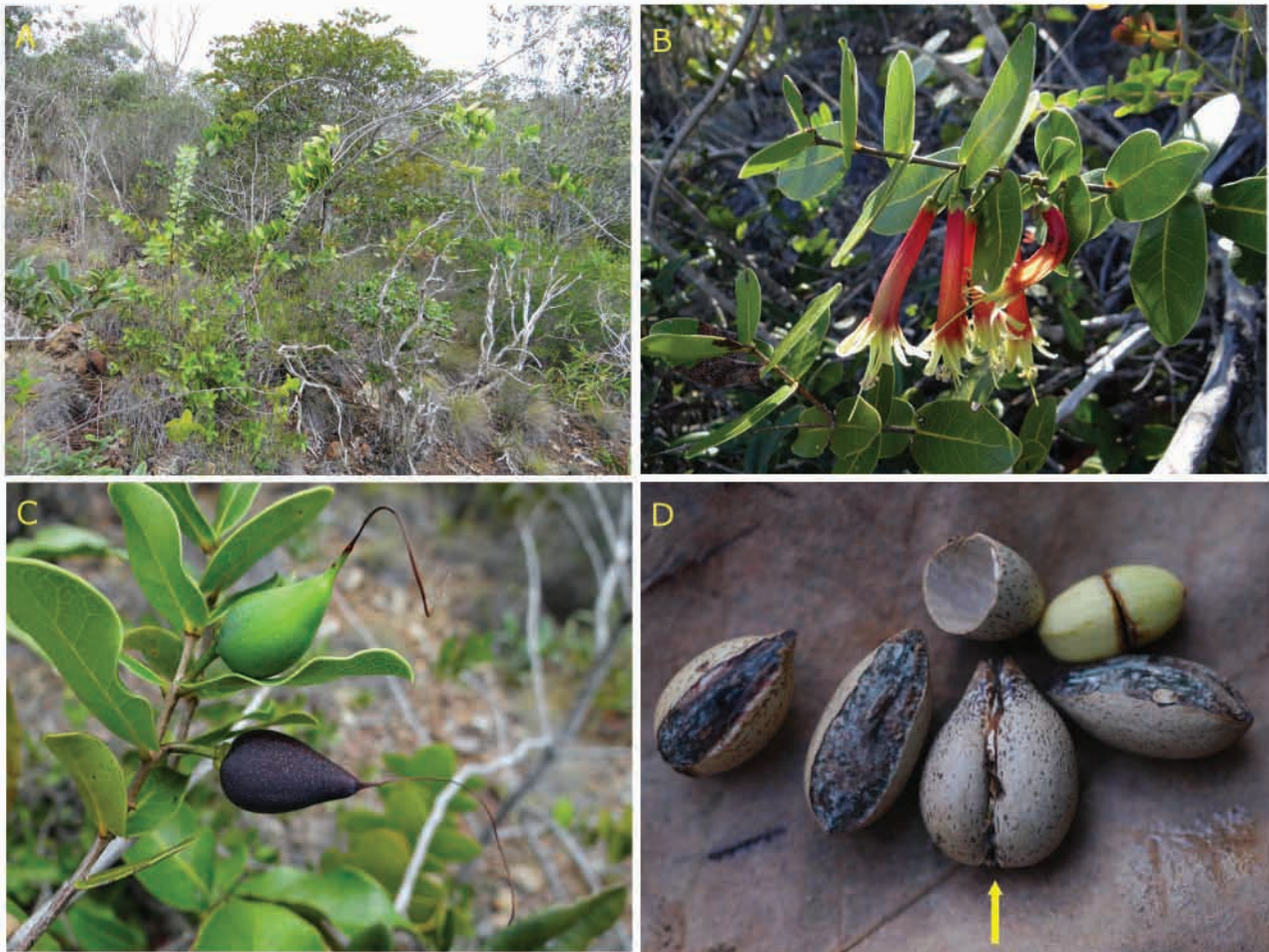
FIGURE 1. Pycnandra longiflora , A. Habit of open maquis, B. Flowering branch, C. Fruits with long persistent styles, D. Seeds from one- or two-seeded (arrow) fruits. Pictures A–C from Rosa Scopetra, D from Jérôme Munzinger.

Pycnandra longiflora (Benth.) Munzinger & Swenson, Austral. Syst. Bot. 28: 101 (2015) (Fig. 1)