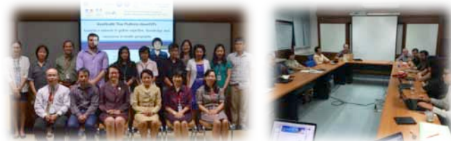
Figure 2: First workshop and GIS training at Mahidol University (April 2014)

Trainings already took place in 2014 on Geographic Information Systems and Remote Sensing techniques. Tutorials are made available for any people interesting in this project. Workshops were held in conjunction with training to develop discussions about methods and challenges of spatial analysis (Figure 2).