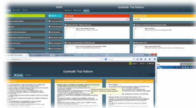
Figure 3: Internet watch in geospatial health ( http://www.netvibes.com/geohtp )