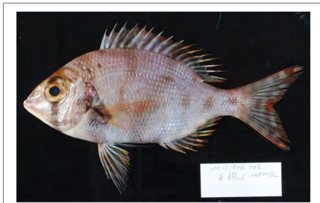
FIGURE 2 | Gymnocranius sp. D from Taiwanese waters. Specimen from Hengchun, southern Taiwan, collected on 19 August 2011; standard length 148 mm.

NC, New Caledonia; GBR, Great Barrier Reef.