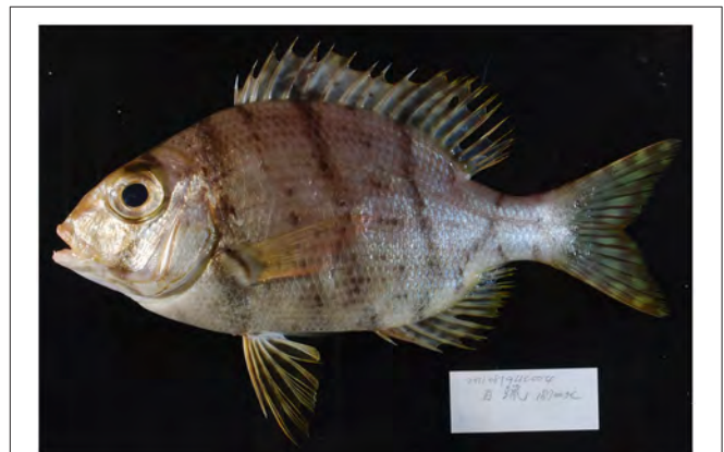
FIGURE 3 | Gymnocranius sp. E from Taiwanese waters. Specimen no. NMMBA 21547 from Hengchun, southern Taiwan, collected on 19 August 2011; standard length 183 mm.

nucleotide divergence was 0.08% in G. oblongus and 0.4% in G. satoi (see below).