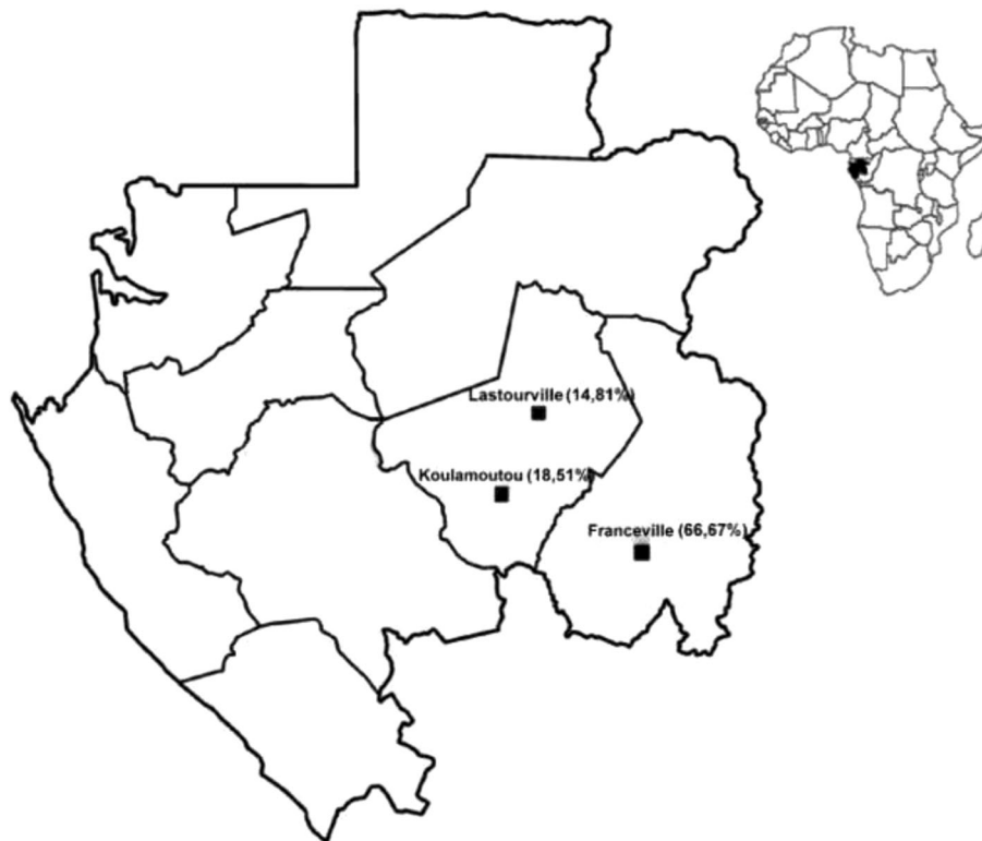
Fig. 1 Lastourville (Rural), KouIAMoutou (semiurban) and Franceville (urban) location in Gabon. Percentages in parentheses indicate the percentage of isolates test by country. Inset shows location of Gabon on the Atlantic Coast of Africa