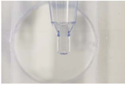
Figure 3. Detail of collector tube tip. doi:10.1371/journal.pntd.0000471.g003

The INRB mAECT kit consists of two cardboard boxes. One contains 20 mAECT columns best stored at 4°C–8°C, although tests are stable for 12 months at a maximum of 37°C. The other contains 20 collector tubes, 20 centrifugation tubes, 20 transfer pipettes, and the instruction leaflet (available in English, French, and Portuguese). Specifications of the kit are given in Box 1.