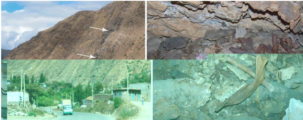
Figure 2. Jatun Uchco of Ambo, Perú. Openings to upper and lower chambers of the caves of Jatun Uchco are indicated on the photo at left. Fossils were obtained by surface collection (right).