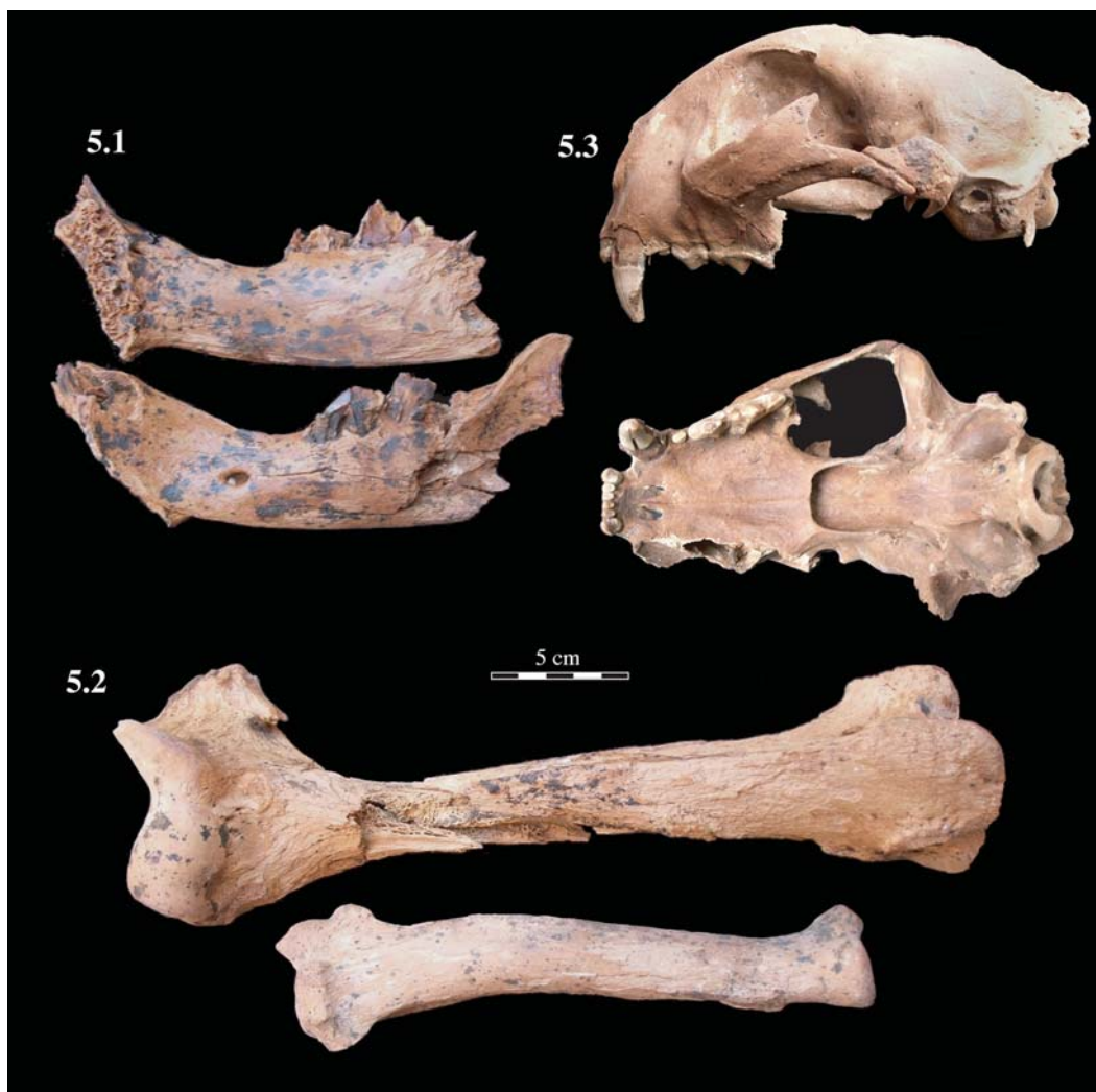
Figure 5. Felids of Jatun Uchco. Jaws (5.1) and left humerus and radius (5.2) of † Smilodon pop la o and skull (5.3) of P ma sp., cf. P ma concolo . Scale bar = 5 cm.

Age. Accelerator mass spectrometry of collagen recovered from a distal phalanx of the sloth † Diabolo he i m (Figure 4.3) yielded a conventional radiocarbon age of 29,140 \pm 260 BP (Table 3).