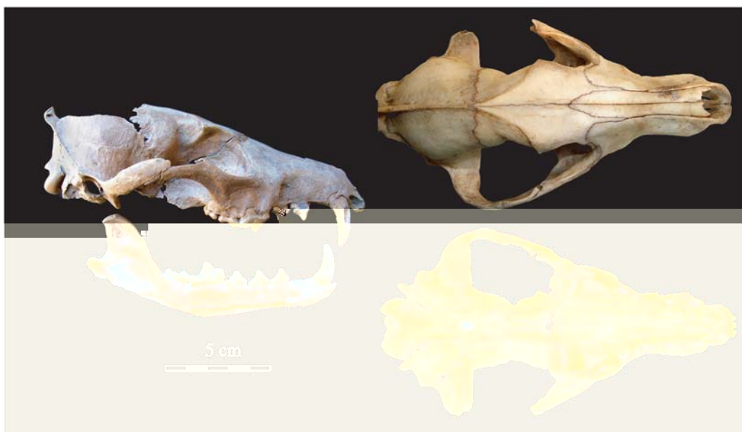
Figure 6. Zo o —Andean foxes. Skull of Lycalopex sp. of Jatun Uchco (left MUSM 679) in lateral view and one from Cueva Roselló (right, MUSM 1383) in dorsal and ventral views.

unable to obtain collagen from † Diabolo he i m specimens of Jatun Uchco (or any other samples attempted from that locality), but organics were recovered from a Trigo Jirka specimen of † Diabolo he i m .