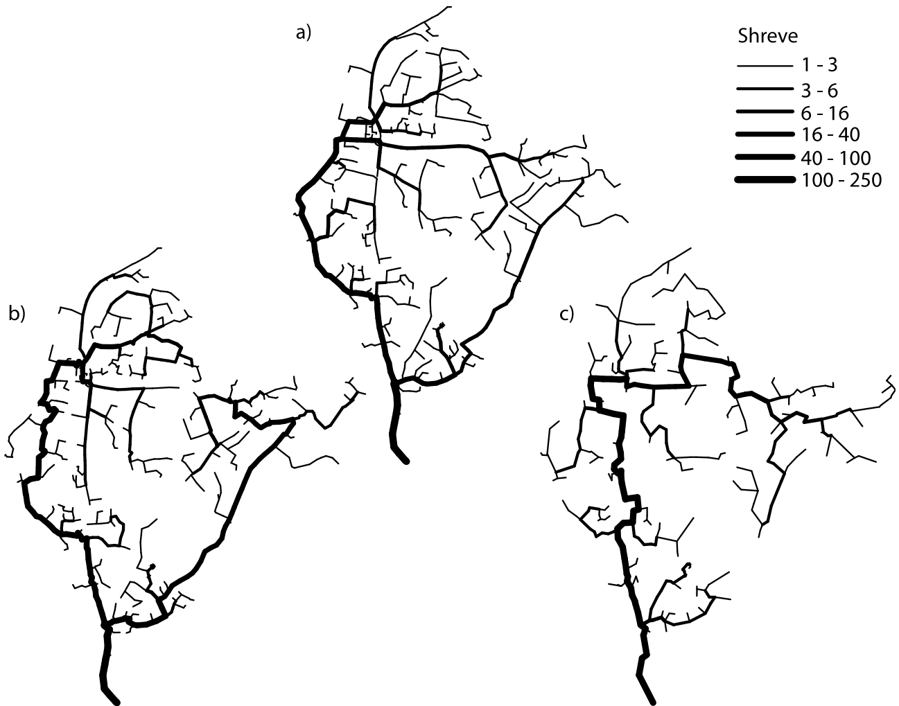
Fig. 1 Comparison between the actual and reconstructed networks using cost function 1 and \alpha=0.9 , \beta=2 and \gamma=5 . a) The actual network; b) The reconstructed network using the entire dataset; c) The reconstructed network using half of the manhole cover locations.

The actual and reconstructed networks (with all and half of the nodes) using the first cost function are presented in Fig.1. The best results are obtained for \alpha \geq 0.7 . This means that distance weights more heavily than elevation when formulated as in Eq.1. When the entire data set is used, the reconstructed and actual networks have similar Shreve stream magnitudes (131 and 125 resp. at the outlet). Based on Heipke et al., (1997), Correctness = 0.89; Completeness = 0.84 and Quality = 0.76 (Tab. 1). These values drop to 0.44, 0.55 and 0.32 respectively when using only half of the nodes and the Shreve stream magnitude at the outlet drops to 84.