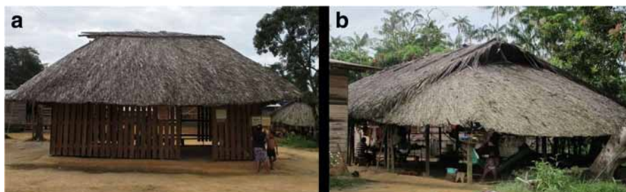
Fig. 2 Left, a ceremonial building with a simple hip roof. Right, b simple hip building with apses, used for cassava flour preparation

The straight cylindrical part of the trunk, measuring from 10 to 15 m, is prepared in situ. The branches are removed with a machete, and then, the bark is stripped from the boles. A machete is used for Annonaceae and Lecythidaceae whose barks are easy to strip off. The blade is inserted along the cambium between the wood and the bark. For the Chrysobalanaceae, which have a