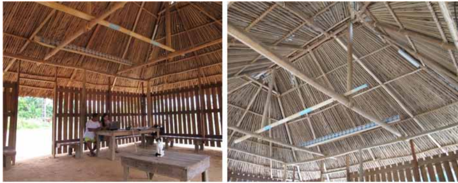
Fig. 5 Ceremonial building at Esperance village, from the inside (same building as in Fig. 2a)

[9] describes as under differentiation: 25% of the total refer to different species in a single genus, 48% refer to species in different genera in the same botanical family, and 2% refer to species in different families (Table 5).