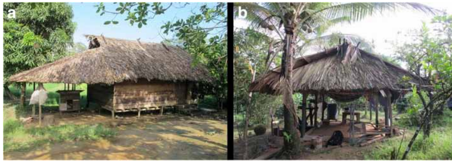
Fig. 3 Left, a living house on stilts. Right, b cooking and resting building annexed to a house

more adhesive bark, the bole is hit with a large stick and scratched with the blade of the machete to peel off the bark. The aim of these processes is to prevent attacks by wood-eating pests and to allow the wood to dry and harden more quickly. In temporary buildings, the bark is sometimes not stripped off, as it peels off spontaneously after drying. The boles are then carried by hand to the construction site, with the assistance of a motor vehicle if available. They are then cut into pieces of the appropriate length for the desired building. These steps are always carried out on green wood, as it hardens and deforms while drying. Depending on the species used, the pieces destined to be used as posts may have their sapwood ( ā gasisin ) (peripheral, non-durable wood) removed with an ax, conserving only the heartwood ( ā gayakni ). This finishing step was observed only once and aims to prevent the wood rotting and to avoid insect attacks.