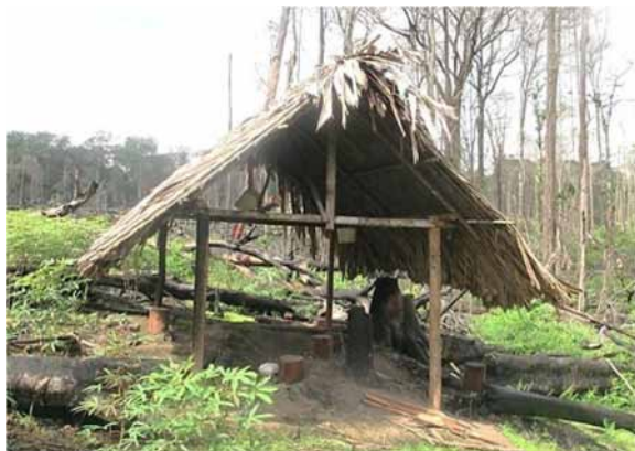
Fig. 4 Light shelter in a cassava field

Once the location of the building has been chosen, the first step is setting up the vertical frame (Fig. 5). The length between two posts is measured in fathoms, i.e., the space between the two hands, arms open wide. Posts