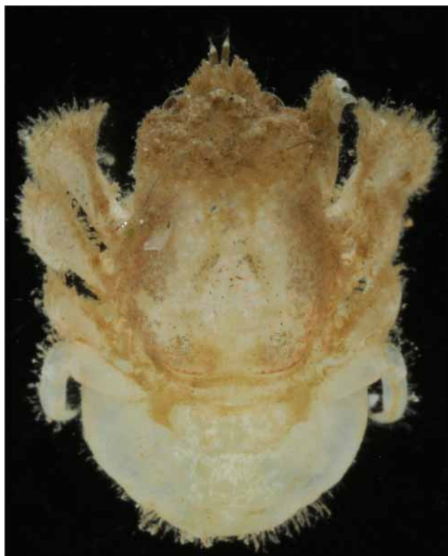
Fig. 1 Female Opecarcinus cathyae collected from 12 m depth in Iguma Bay, Haha-Jima, Ogasawara Islands (Japan) from the scleractinian coral Pavona clavus

described Fizesereneia daidai Zayasu, 2013 (Komatsu 2011; Zayasu et al. 2013).