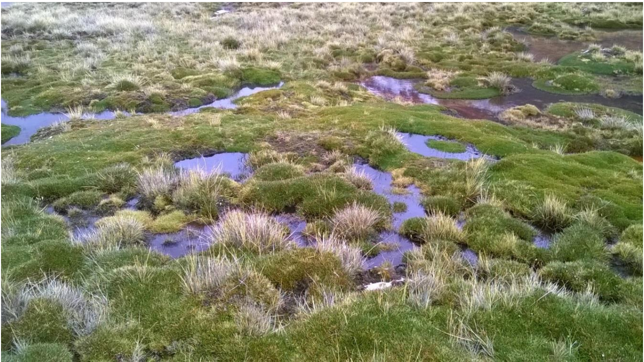
Figure 2. Bofedal with Oxychloe andina being overtaken by Festuca dolichophylla . Note that as F. dolichophylla density increases (upper left) the cover of surface water decreases. This shift in plant community is an indicator of bofedal degradation.

The increased pressure, combined with species shifts and changes in climate patterns, could result in long-term negative effects for the ecological functioning and sustainability of bofedales. Analysis of rainfall observations in the region show a trend of decreasing precipitation (Vuille et al. 2003). Otto & Gibbons (2017) found that rainfall is significantly correlated with bofedal density and bofedales located on the western slopes (250–470 mm rainfall) of the tropical Andes mountain range are more sensitive to rainfall than bofedales on east-facing slopes (1,000 mm rainfall). Our study area has a mean annual rainfall of 700 mm. If the projection reported by Vuille et al. (2003) holds for our study area, the number and size of bofedales could decrease, with direct impacts on biodiversity and negative effects on the livelihoods of local communities. More recently, Dangles et al. (2017) observed that while the overall areas of bofedales may increase due to changes in climate patterns, fragmentation of individual bofedales will increase, hence the area and connectivity of vegetation communities will decrease. Changes in temperature and rainfall patterns as well as glacier cover are promoting the upward migration of structuring bofedal species. However, these migrations seem to be particularly slow, generating a time lag between the changing climatic trends and the speed of bofedal succession