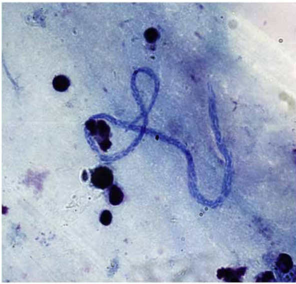
FIG. 1. Mansonella perstans microfilaria in thick blood film collected from a Senegalese patient (Giemsa staining; original magnification, \times 1000 ).