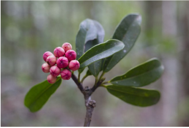
FIGURE 1 Flowering stem of Symphonia globulifera (Clusiaceae), one of the 704 tree species identified in the Piste St Elie long-term research plot, located in the tropical rain forest of French Guiana. This species has at least one congener in the study plot, as 80% of the species, and its seeds are dispersed by animals, as 87% of the species.

it is now well established that the genetic diversity of dominant species can feed back on the whole community (Bolnick et al., 2011; Crutsinger et al., 2006). Hence, a full analysis of community structure should integrate functional and phylogenetic intraspecific and interspecific components (Bolnick et al., 2011; Pavoine & Izsák, 2014). Whereas a few population genetic studies have sampled and analyzed multiple species simultaneously (Petit et al., 2003; Taberlet et al., 2012), they have not focused on the genetic diversity of entire communities. Performing such a study would provide a unique opportunity to investigate shared genetic variation across species and clarify its origin. It could also help identify new avenues to understand the evolution of communities.