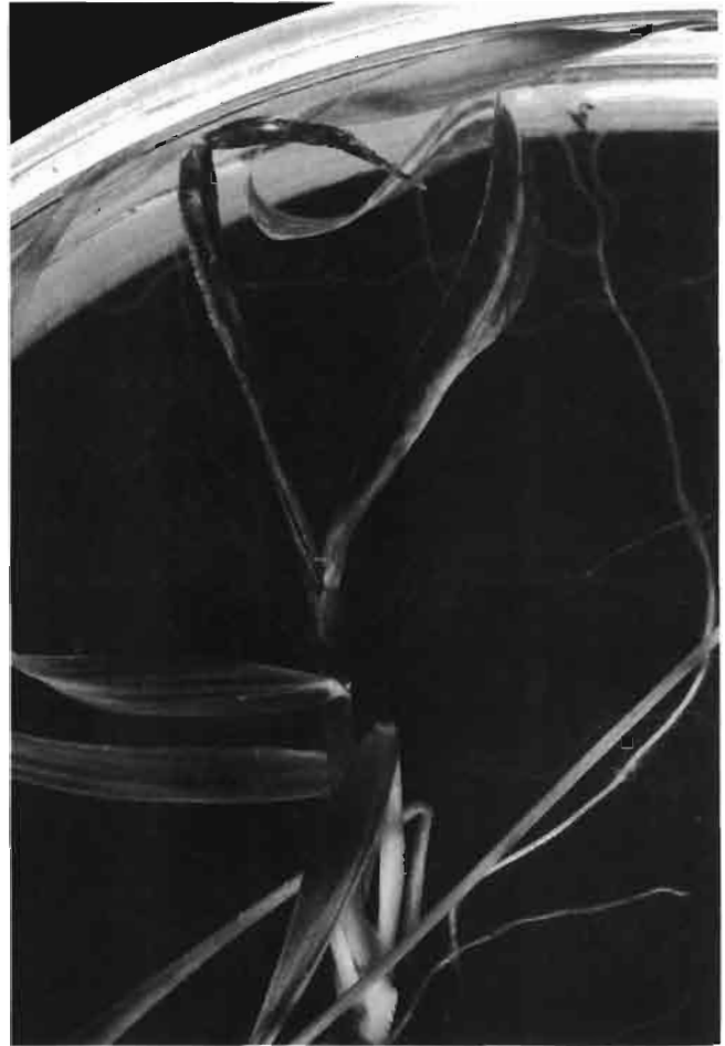
Fig. 2. Monoxenic culture of Ditylenchus angustus on seedling of rice cv. IR36. Note foliar symptoms.

The reproduction of D. angustus on the following tissues was assessed and compared with that obtained using the above seedling technique: 1) callus tissues, of i) Oryza sativa cvs NC492 and IR36 induced from mature embryos and cv. Speaker induced from immature inflorescences, ii) Triticum aestivum cv. Copain from immature embryos, iii) Triticum monococcum from immature embryos, iv) Solanum tuberosum cv. Desiree induced from stems, v) Nicotiana rustica from stems, vi) Medicago sativa cv. Sabilt from germinating seed and