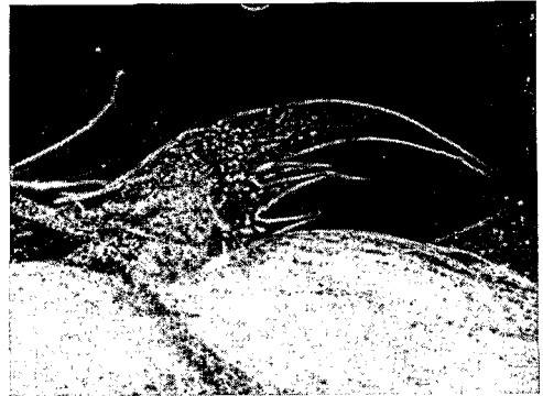
FIG. 1. E. eximia . Protuberances of the distal end of the second segment of the first antennal peduncle. Foreground: outer protuberance (simple). Background: inner protuberance (trifurcate); on the right, beginning of the dorsal keel of the third segment.

Mus. Comp. Zool., Harvard College 35:177–296.