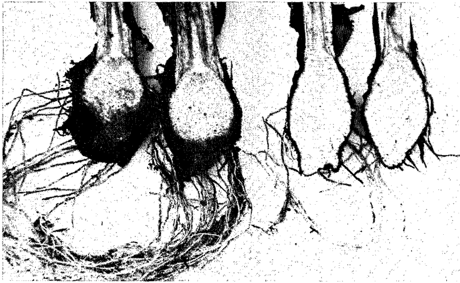
Fig. 3. Main taro corms infested with H. miticausa n. sp. (left) and without nematodes (right).