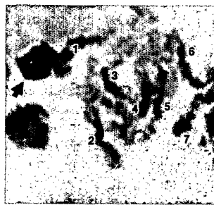
FIG. 2 Cytology of male spermatocyte. The arrow indicates the degenerating paternally derived set of chromosomes and the presumptive maternally derived set are numbered 1-7.

susceptible alleles fail to amplify in males when paternally derived. These data are confirmed by the simultaneous use of SSCP on the same amplification products: SSCP banding patterns for the S(S) and S(R), and the R(R) and R(S) each show the same pattern, because the paternally derived alleles (in parentheses) are not amplified in males (Fig. 1). This again appears consistent with haplodiploidy, in which males would be haploid and females diploid.