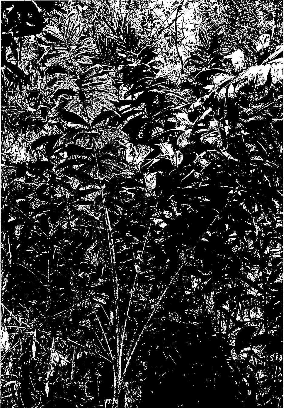
FIG. 1. Habit of Bactris pliniana (de Granville & Kahn 5405).

ana, flowers have been observed mostly from June to November and fruits from December to May. The seeds germinate in 6–8 months.