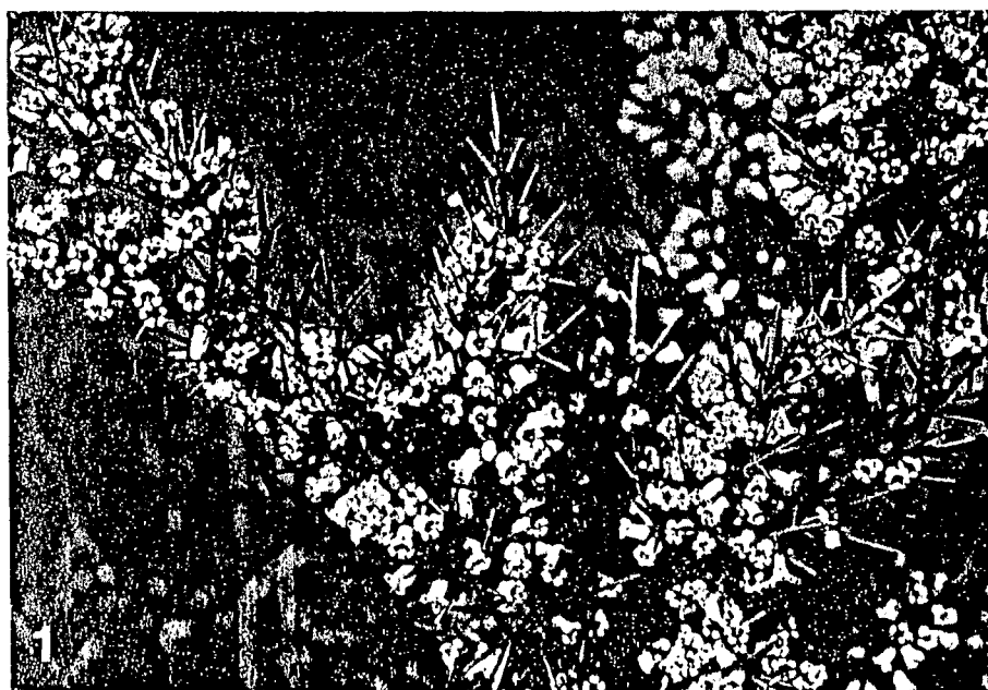
Plate I. FIG. 1. — A bush of spontaneously growing Colletia spinosissima at flowering stage, Embalse Dam, Rio Tercero, Argentina.

Seeds, nodules and rhizosphere soil of Colletia spinosissima were collected on plants growing in a stony soil close to Embalse Dam on the Rio Tercero, Argentina (plate I, fig. 1), a location with a low rainfall (600 mm per annum, with rain occurring mainly in spring and summer).