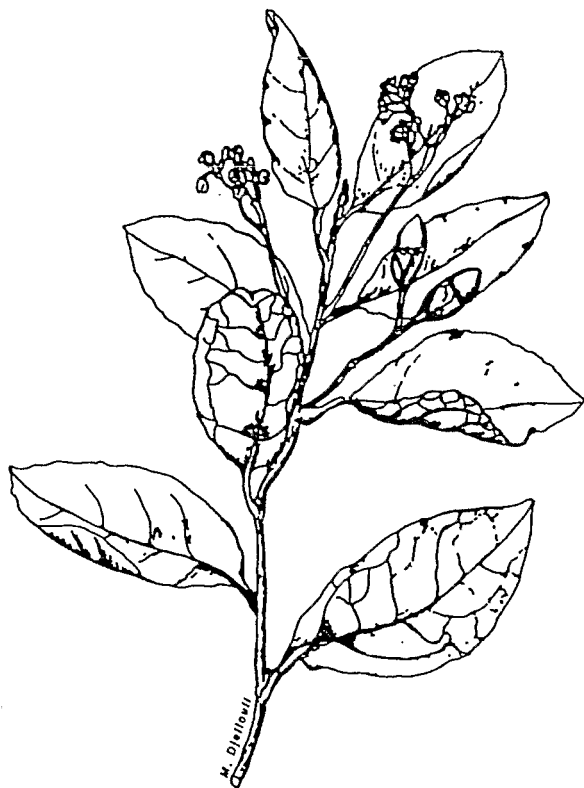
Figure 3. Ocotea foetens , a Macaronesian laurel. The Garoé was an O. foetens . Drawn by M. Djellouli.

The Canary Islands are essentially influenced by the subtropical high pressure systems of the north Atlantic Ocean, trade winds being the factor driving the atmospheric circulation. These winds from the NNE are humid (relative humidity 75–90 percent) and collide with the insular blocks, producing a “sea of clouds,” the altitude of which usually ranges from 600 to 1,500 m. In the vicinity of Tenerife island, the average frequency of occurrence of the “sea of clouds” is 199 days per year. These clouds do not result in abundant rainfall because an upper-level temperature inversion restricts their vertical growth and the formation of a deep cloud layer necessary for raindrop formation. Mount Garajonay National Park (elevation 700–1,487 m) has an evergreen forest sustained by direct interception of cloud water. The mean annual rainfall in the area ranges from 600 to 800 mm. It is estimated that forest fog/cloud-water interception is more than double this amount (Santana Pérez 1990; Gischler 1991).