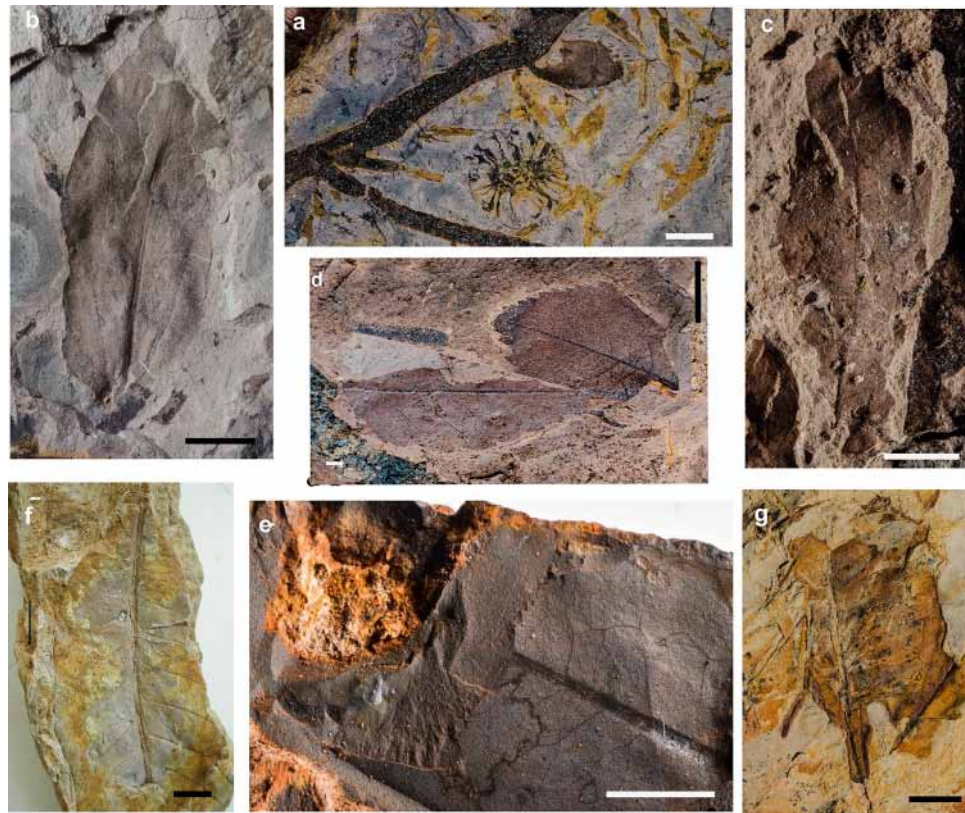
Figure 2. Fossil plants and insect activities. (a) cone of taxodiaceous Cupressaceae; (b–d) leaves; (c) insect activities on a leaf (Late Cretaceous, Haute Nessadiou); (e) insect activities on leaves (Late Cretaceous, Haut-Robinson); (f, g) insect activities on leaves (Nepoui, Early Miocene); Copyright R. Garrouste. Scale bars = 1 cm.

parallel to and east of the main island. The Grande Terre is the emerged northernmost part of the ‘microcontinent’ Zealandia 25 .