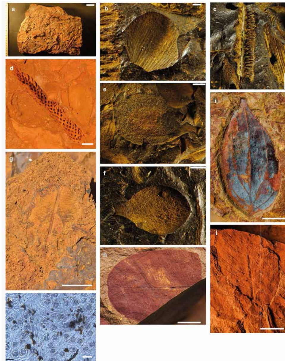
Figure 3. Middle(?) Miocene plants. (a–f) La Madeleine outcrop; (g–j) Pont des Japonais outcrop. (a) Mad_1 from Madeleine showing the very dense fossils assemblage; (b) inflorescence bract of Styphelia sp. (Ericaceae ex-Epacridaceae), Mad_1_A_Fe142; (c) fern pinnule, Mad_1_Fe49; (d) axis with 48 leaves of cf. Dacrydium sp. (Podocarpaceae), Mad_17_A_Axe1; (e) leaf of Melaleuca sp. (Myrtaceae), Mad_1_A_Fe171; (f) probable petal of dicotyledon, Mad_1_A_Peta115; (g) leaf of Solmsia sp. (Thymelaeaceae), Mad_22_A_Fe1; (h) leaves of Calophyllum cf. caledonicum (Calophyllaceae), Pjap_21_A; (i) leaf very similar to that of an extant species of Cryptocarya (Lauraceae), Pjap_46_A_Fe1; (j) leaf of Alphitonia cf. caledonica (Rhamnaceae), Pjap_55_A_Fe2; (k) imprint of Mad_6_Fe1 showing epidermis and stomata (same type of leaf as specimen figured in 3i). Scale bars (b) & (f) = 1 mm; (e) & (c) = 2 mm; (d) = 5 mm; (k) = 50 \mu\text{m} .

and erosion sequence positions). We were unsuccessful in our attempt to use electron spin resonance (ESR) to date quartz grains at the two major fossil localities (La Madeleine and the Pont des Japonais), where quartz grains are exceedingly rare.