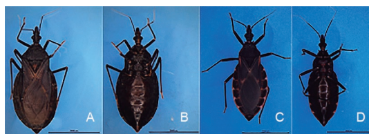
Fig. 2: the novel species of Triatoma sp. captured in Dali, Yunnan province (A back B ventral), T. rubrofasciata captured in Shunde, Guangdong province (C back D ventral).

kled, the top of it was slightly upwarping, oblique uplift in the centre of both sides (Fig. 1A-B). The conserved 16S ribosomal RNA gene, the Cytochrome b gene and 28S ribosomal RNA showed 93.08%, 77.16% and 91.55% similarities to T. rubrofasciata in GenBank, respectively. The sequences obtained from 16S rRNA of the Dali species were submitted to GenBank under the accession number MN200191. The phylogenetic trees were constructed using the 16S rRNA gene of the Dali species and other triatomines in GenBank and were based on the neighbor-joining method by MEGA6.0 (Molecular Evolutionary Genetics Analysis Version 6.0). The result showed that the Dali species fits in the same clade of T. rubrofasciata (Fig. 3). Morphological and molecular data suggest that it could be a novel Triatominae species. T. rubrofasciata specimens were collected mostly (1035/1041) inside human houses (60.9%) and domestic animal shelters. Most of the specimens (780/1041) were captured between July and August.