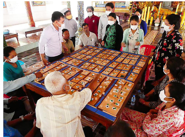
Fig. 1. A prek in the mosaic landscape of in Kandal (left) and discussion around a serious game , Kandal province, August 2020 (right).

Participatory critics might well reply that these precautions are not sufficient to immunize serious games against charges of depoliticization. After all, there are still implicit, framing assumptions, the games still simplify complex problems, and they render those problems technical in many ways. For example, although participants are given room to question and even modify game design (Daré & Barreteau 2003; Patamadit & Bousquet 2005), it happens against a backdrop of ideas, rules, and more or less explicit objectives defined by researchers or development experts during preparatory workshops where the participants are often absent.