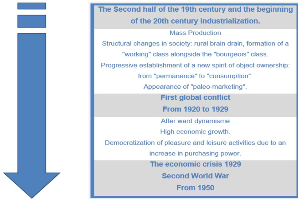
Figure 2. The Periods of Implementation of the Consumption Society Diagram

advertising, marketing) should therefore come to serve this new philosophy of commerce that would lead to a consumption society. The following diagram provides a summary of the major stages described above, up to the effective implementation of the consumption society. Note the breaks linked to events crisis (wars or economic slowdown) that have delayed its occurrence.