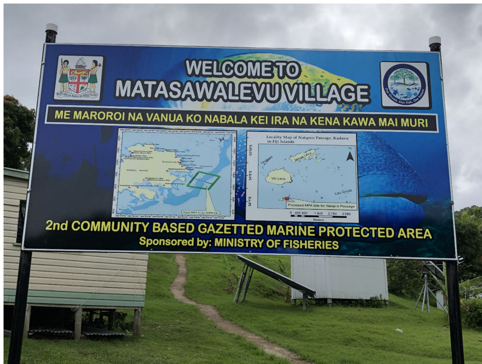
Fig. 2 Information boards for the gazetted MPA at the entrance of Matasawalevu village (2019).