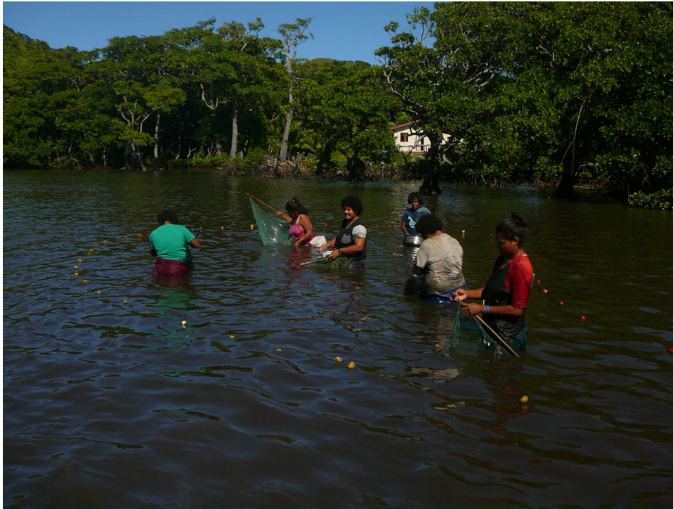
Fig. 3 Women collectively fishing for vaya at Matasawalevu in May, 2019.

and especially the women, were very attached to it. We have been able to personally witness women’s collective catch of vaya in Matasawalevu (Fig. 3). As per Gordon (2013, p. 337), we have observed that “Women enjoy fishing [ vaya ] together; laughter and joking features prominently in this experience.” Saqa , on the other hand, is often sold by local fishers, 25 while it is also regarded as a very smart marine being (or even a ‘social partner’ or counterpart rather than a ‘prey’?; Bataille-Benguigui 1988). Both finfishes have a high sociocultural significance, as a local delicacy, a ‘totem fish,’ and a ‘chiefly fish.’ They illustrate that the term ‘totem fish’ covers human–fish connections at the individual (“my fish”), clan ( yavusa ), and village levels, while being a key element of the possible relationships between chiefs and their people, seen (or even idealized) as reciprocal: “the people serve him [their chief], who in turn serves the people by redistributing the wealth while ensuring peace and abundance” (Pauwels 2015, p. 189). These ‘totem fish’ can be described as “symboliz[ing] custodianship and link between the community and the environment” (Ratuva 2007, p. 104), here coastal/marine areas. However, as they are targeted, caught, and locally eaten, they do not seem to be considered “sacred and representative of [people’s] ancestral being,” which would imply that “these fish are not eaten or disturbed because these are believed to invoke the wrath of