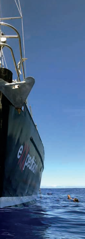
Figure 1: An all-female sailing expedition or 'eXXpedition'.

that they can then contribute to tackle it, in their own ways and at different levels, for instance through actions in the field of awareness-raising, recycling, fashion, or even tattooing. This focus is also encapsulated in the book's final words, which are those of a crewmember from Rapa Nui: "I understand that if I can do it, anyone can do it. [...] We have to do better." (p.113; my translation).