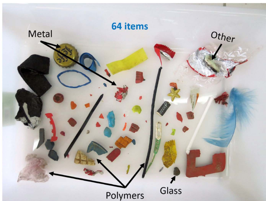
Figure 2. The 64 items found on the Pic Saint-Loup hiking trail on December 29, 2019.

Five pieces of metal and five pieces of glass were also found (8% in number; 20% and 22% in mass, respectively). One element (a chewing gum) constituted the “other” class (5% in mass). The disastrous ubiquity of plastics was sadly confirmed, but the most striking observation concerned the “archeology” or the “object narratives” of this litter sample (Figure 3C,D). “How did these objects get here, and what behaviors caused them to follow a particular course that resulted in becoming pollution?” , p. 230 in Schofield et al. [2020]. Moreover, what actions might have prevented this outcome?