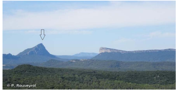
Figure 1. Pic Saint-Loup (source: https://inpn.mnhn.fr/site/natura2000/FR9101389?lg=en ). The trail joins the summit from the south (on the left of the arrow).

I made my annual walk on December 29, 2019. The parking at the trailhead was empty and I began walking at sunrise (~8 am). The weather was humid and mild, in perfect harmony with the landscape freshly washed by the morning dew. Unfortunately, few minutes into the hike, a small red object trapped between two stones caught my eye. I picked it up and placed it in a zip-lock bag. I encountered and picked up other objects several times during the 3 km