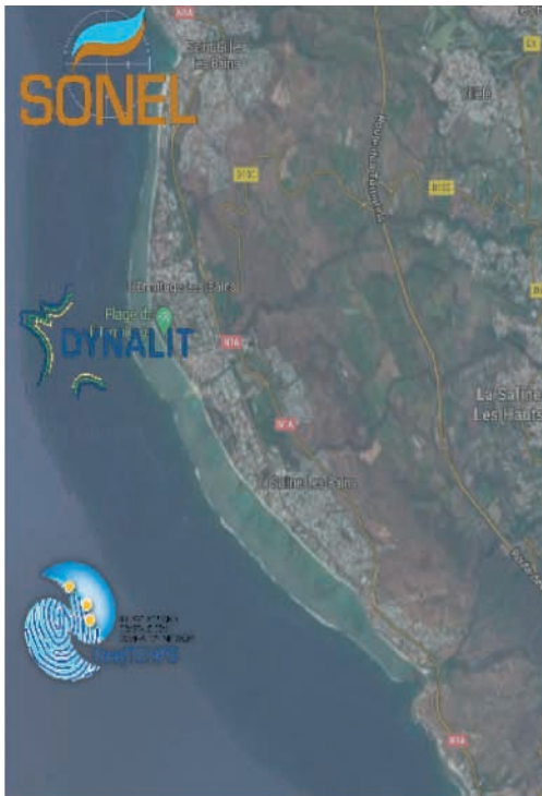
Fig. 2. Hermitage lagoon site, one of ILICO's overseas integrated multiple instrumented pilot sites involving SONEL, DYNALIT and REEFTEMPS networks. Discussions and planning to integrate other networks (such as SOMLIT and CORAIL) are ongoing.