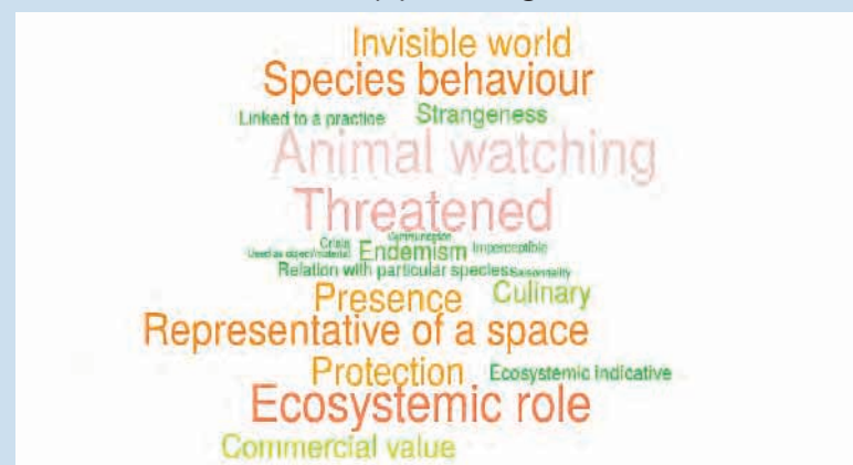
Figure 2: Main reasons given to justify the designation of "emblematic species" (size of words relates to the number of mentions). Interviews conducted in 2017 by the authors