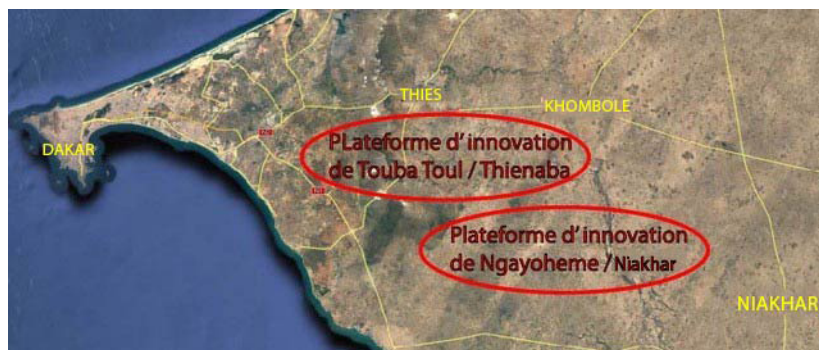
Figure 1. Position of the two Senegalese innovation platforms — Position des deux plateformes d'innovation sénégalaises.

In Burkina Faso the RAMSES II project responded to the need for intensification of agroforestry parks dominated by shea trees ( Vitellaria paradoxa ). A reflection on the potential to create an IP was conducted by INERA, the Institute for the Environment and Agricultural Research of the National Centre for Scientific and Technology Research (in French, Institut de l'Environnement et de