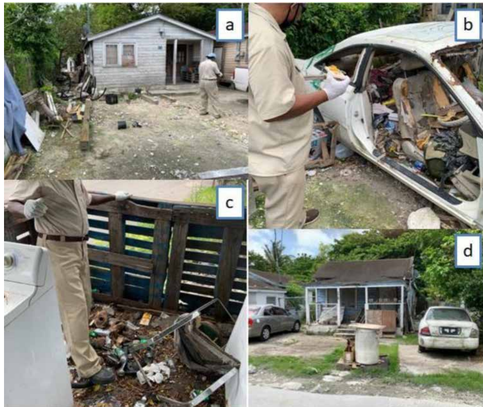
Figure 2. Some of the conditions that may influence rodent population as observed here in the Bahamas during the WHO/PAHO Bahamas rodent surveillance training workshop: (a) residence with construction materials and other debris, (b) residence with a wrecked/abandoned vehicle, (c) residence with an unkempt surrounding, and (d) residence bordering abandoned building and vehicle.

To investigate factors possibly influencing rodent infestation using active rodent signs (i.e. rodent runs, burrows, faecal or gnawed material) as a proxy in the poor urban community under study, 16 variables with p -values of \leq 0.15 from an initial separate analysis were included in the final model (Supplementary Annex III). Of these 16 variables, the final model (Table 2) retained eight (namely: area; residence with unapproved refuse storage; exposed garbage; source of animal food; other sources of food; bulk wastes; construction materials; and residence with structural deficiencies) with an Akaike Information Criterion (AIC) of 345.9, and the model with the fewest number of variables.