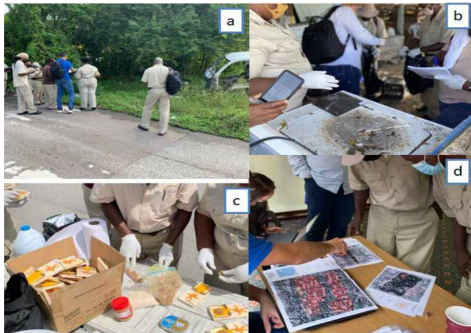
Figure 1. Cross-section of some of the participants and training facilitators during the WHO/PAHO Bahamas rodent surveillance training workshop (a) team briefing during the exterior rodent surveillance exercise, (b) the team photographing and examining the TP for a possible rodent mark, (c) the participants preparing and apportioning appropriate baits to the STs before the STs are setup for rodent capturing, and (d) training facilitators explaining how to go about collaborative mapping to some of the workshop participants.

As part of the training exercise, the DEHS representatives, WHO and PAHO officials and the training facilitators (experts) met with representatives of the local community (11 focal persons selected from the surveyed households for comprehensive community engagement). The purpose of this initial meeting was to extensively—(1) evaluate the community perception about rodent infestation using a collaborative mapping approach, where the local community members were tasked to identify areas with rodent-related problems, and (2) discuss the problems responsible for the rodent infestation and recommend possible solutions to the identified problems jointly with the community members, the training facilitators and the DEHS, WHO and PAHO officials (Fig. 1d). Summarily, from the community meeting report, the majority of the participants (at least 8 out of the 11 participants) indicated that certain areas were well-conserved with reasonably satisfactory waste disposal practices, while others displayed characteristics such as: ownership problems (houses with unknown owners, often under lock and as a result preventing accessibility during rodent surveillance/control); haphazard waste disposal and irregular pick-up schedules leading to garbage pileups; lack of access to dumpsters; abandoned houses; non-collection of bulk waste e.g. derelict vehicles and construction materials offering rodents harbourage sources