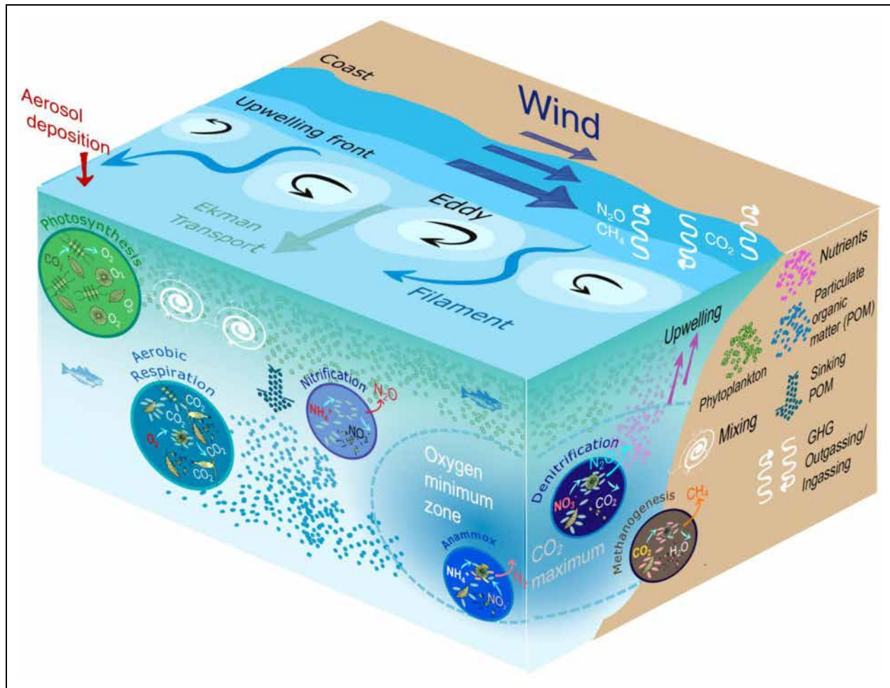
Figure 2. Overview of physical and biogeochemical processes in major coastal upwelling systems. Upwelling-favorable winds cause upwelling of nutrient-rich waters along the coast, fueling productivity in the sunlit layer. While biological carbon fixation can promote \text{CO}_2 uptake from the atmosphere, the upwelling of deep, carbon-rich waters can lead to \text{CO}_2 outgassing, especially in nearshore areas. Intense aerobic respiration results in the build-up of inorganic carbon and the depletion of oxygen at subsurface, resulting in the formation of a perennial oxygen minimum zone (OMZ) within the poorly ventilated subsurface layer, notable for its high carbon concentrations. Anaerobic respiration such as denitrification (predominantly occurring in the suboxic core of the OMZ) and methanogenesis (primarily occurring in anoxic sediments) generate potent greenhouse gases (GHG), namely \text{N}_2\text{O} and \text{CH}_4 , respectively. \text{N}_2\text{O} is also generated as a by-product of nitrification in the oxycline. The release of GHG into the atmosphere is modulated by solubility gradients driven by surface temperature, as well as by the presence of mesoscale and submesoscale eddies and filaments. Furthermore, the atmospheric deposition of nutrients, such as iron (through mineral dust deposition), can also stimulate productivity and consequently, influence the emissions of GHG into the atmosphere.

subsurface oxygen minimum zones (OMZs). However, unlike in the four eastern boundary upwelling systems where the regions of maximum oxygen deficiency are co-located with the upwelling zones along the eastern boundaries of the Atlantic and the Pacific oceans, the Arabian Sea OMZ (the world's thickest) is shifted eastward from the region of upwelling in the western Arabian Sea (Morrison et al., 1999; McCreary et al., 2013; Rixen et al., 2020; Vinayachandran et al., 2021). Beyond the differences observed among the various systems, substantial spatial heterogeneity is also evident within each major coastal upwelling system. This diversity includes variations in dynamics, seasonality, and the sources of upwelling waters between their northern and southern subregions