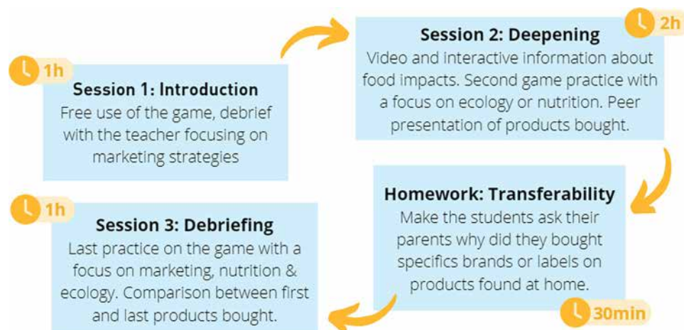
Fig 3. Content of the intervention.

https://doi.org/10.1371/journal.pone.0306781.g003