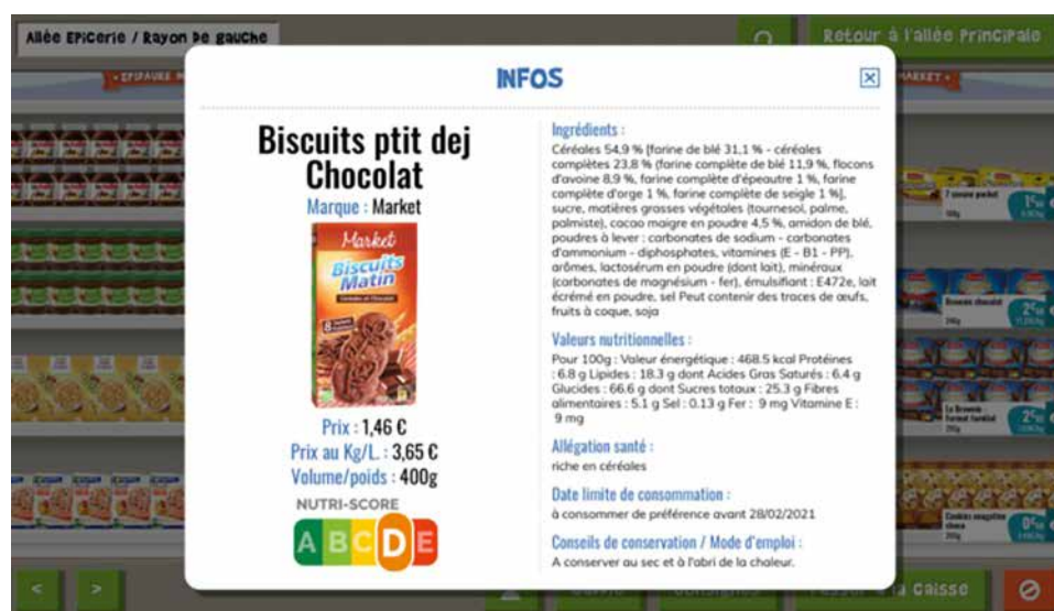
Fig 2. Example of the information given on food labels.

The Epidaure Market v2.0 intervention is a school action adapted to the science curriculum and delivered by the Life and Earth Sciences teacher for 4th and 5th graders. The intervention