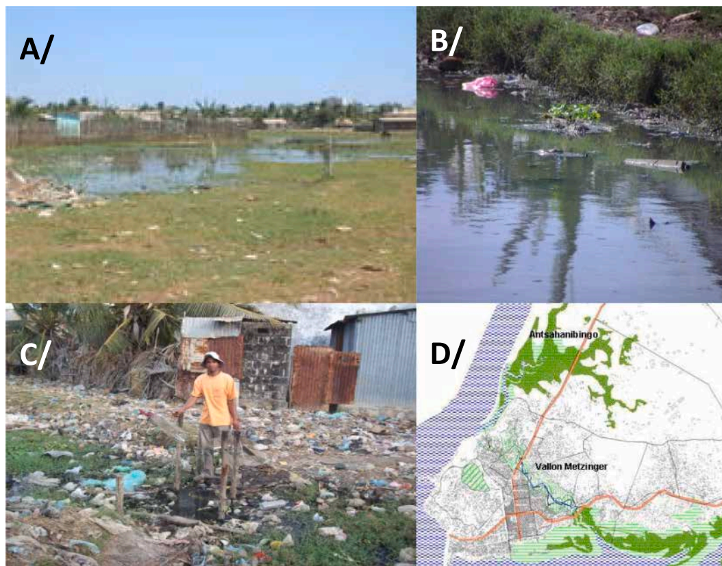
Fig. 1. A-B-C) views of the suburbs around the Metzinger channel. D) Map of Mahajanga with in blue the channel.

Regarding epidemics, the informal suburbs of the Mahajanga city have been hit by such diseases, including plague and cholera, which are linked to sanitation problems, precariousness and poverty (Migliani et al., 2000). This is the case of the Metzinger valley,