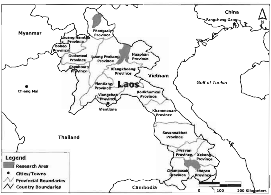
Figure 1. Map of the study site