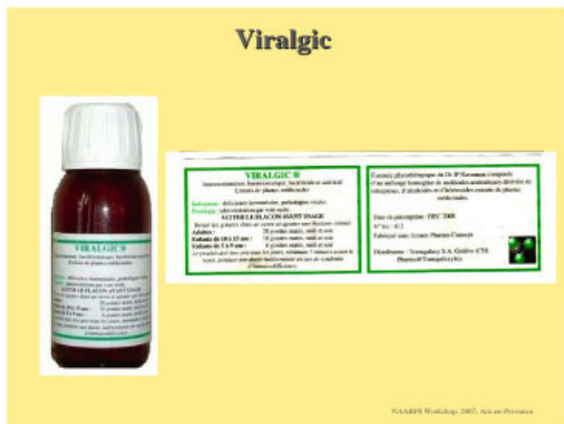
Figure 1 Viralgic, West Africa.

prescribe alternative products such as Immuboot (NHi2T) or Viralgic (Pharma Concept) (see Figure 1).