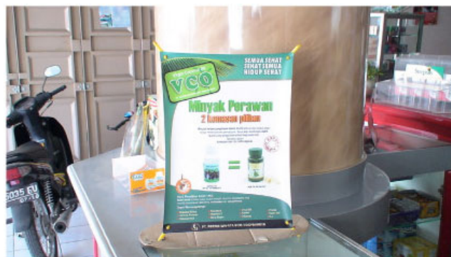
Figure 3 VCO, Indonesia.

Content analysis of the package information for VCO in Indonesia revealed that they are marketed as real 'cure-alls', i.e. to kill viruses and bacteria and/or strengthen the