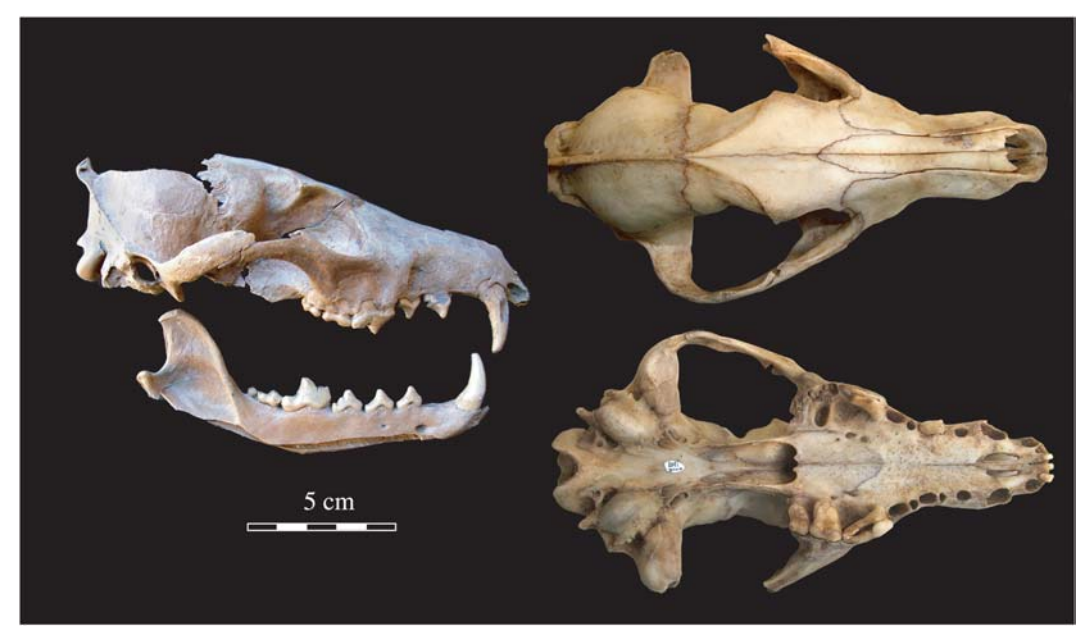
Figure 6. Zorros—Andean foxes. Skull of Lycalopex sp. of Jatun Uchco (left MUSM 679) in lateral view and one from Cueva Roselló (right, MUSM 1383) in dorsal and ventral views.

unable to obtain collagen from †Diabolotherium specimens of Jatun Uchco (or any other samples attempted from that locality), but organics were recovered from a Trigo Jirka specimen of †Diabolotherium .