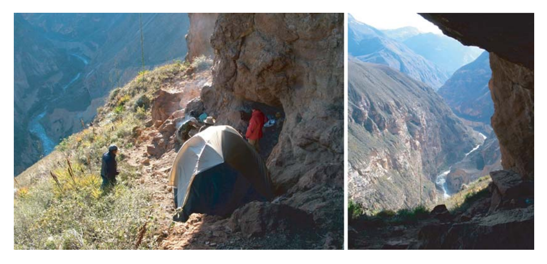
Figure 9. Trigo Jirka . Our camp (left) on the ledge beside the mouth of the cave at Trigo Jirka. The cave is about 300 m (about a 1,000 ft) above the Río Marañón (right, a view from mouth of the cave). The Marañón is a major tributary of the Amazon River.

(see Figure 7). Previously, it had been thought that vicuña did not migrate into high elevation regions of the Andes until less than 12,000 years ago (Wheeler et al. 1976; Hoffstetter 1986; Marín et al. 2007). However, our calibrated radiocarbon age of 22,220 \pm 130 BP from bone sample of vicuña along with that of 23,340 \pm 120 BP from a nearby (coeval or nearly so) ? Onohippidum devillei specimen strongly suggest that vicuña migrated to the central Andes about 10,000 years earlier than previously thought.