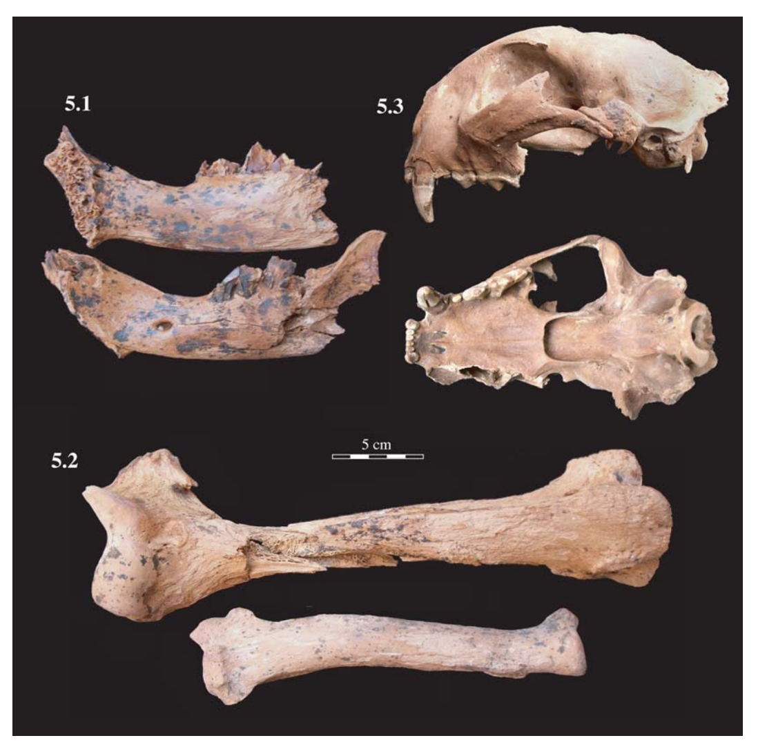
Figure 5. Felids of Jatun Uchco. Jaws (5.1) and left humerus and radius (5.2) of †Smilodon populator and skull (5.3) of Puma sp., cf. Puma concolor . Scale bar = 5 cm.

of the pollen is that of Alnus sp., the Andean alder of the birch family, Betulaceae. There were also many spores of club moss ( Lycopodium ), ferns, and fungi.