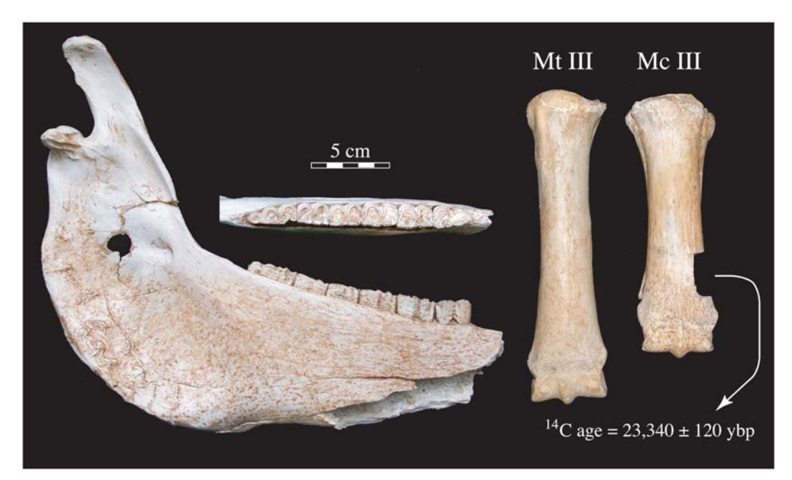
Figure 8. Extinct horse Onohippidium devillei . Mandible (left), (MUSM 613) and metapodials. (The metacarpus shows where sample was removed for radiocarbon dating.)

The most common remains of any mammal at Cueva Roselló were those of vicuña ( Vicugna sp.)