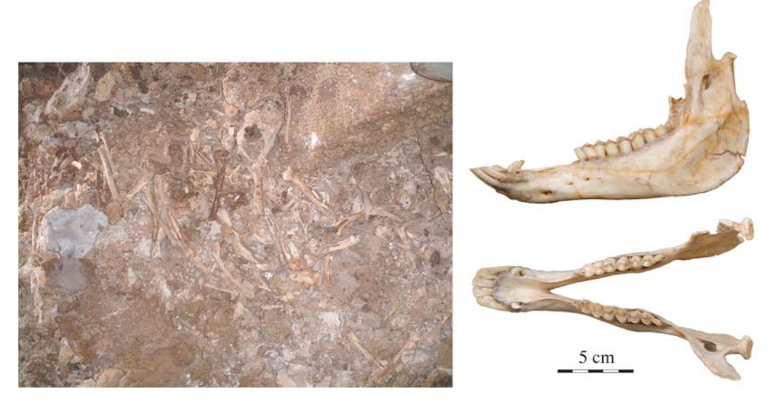
Figure 7. Cueva Roselló. Photo (left) of the floor of cave illustrates the concentrations of fossils. Most shown are those of Vicugna sp. Jaw of Vicugna sp. (right, MUSM 1387).

ing such cliffs and the elevations of the entrances would have made it difficult for carnivores to carry prey items to such heights along steep rock surfaces. Cueva Roselló, however, is located on the Altiplano, the high plains between the eastern and western ranges of the Andes. Such relatively flat terrain would have allowed ungulates close proximity to the cave. As previously mentioned, we think