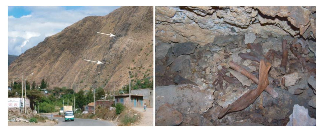
Figure 2. Jatun Uchco of Ambo, Perú. Openings to upper and lower chambers of the caves of Jatun Uchco are indicated on the photo at left. Fossils were obtained by surface collection (right).

mil to yield the Conventional Radiocarbon Age (Stuiver and Polach 1977).