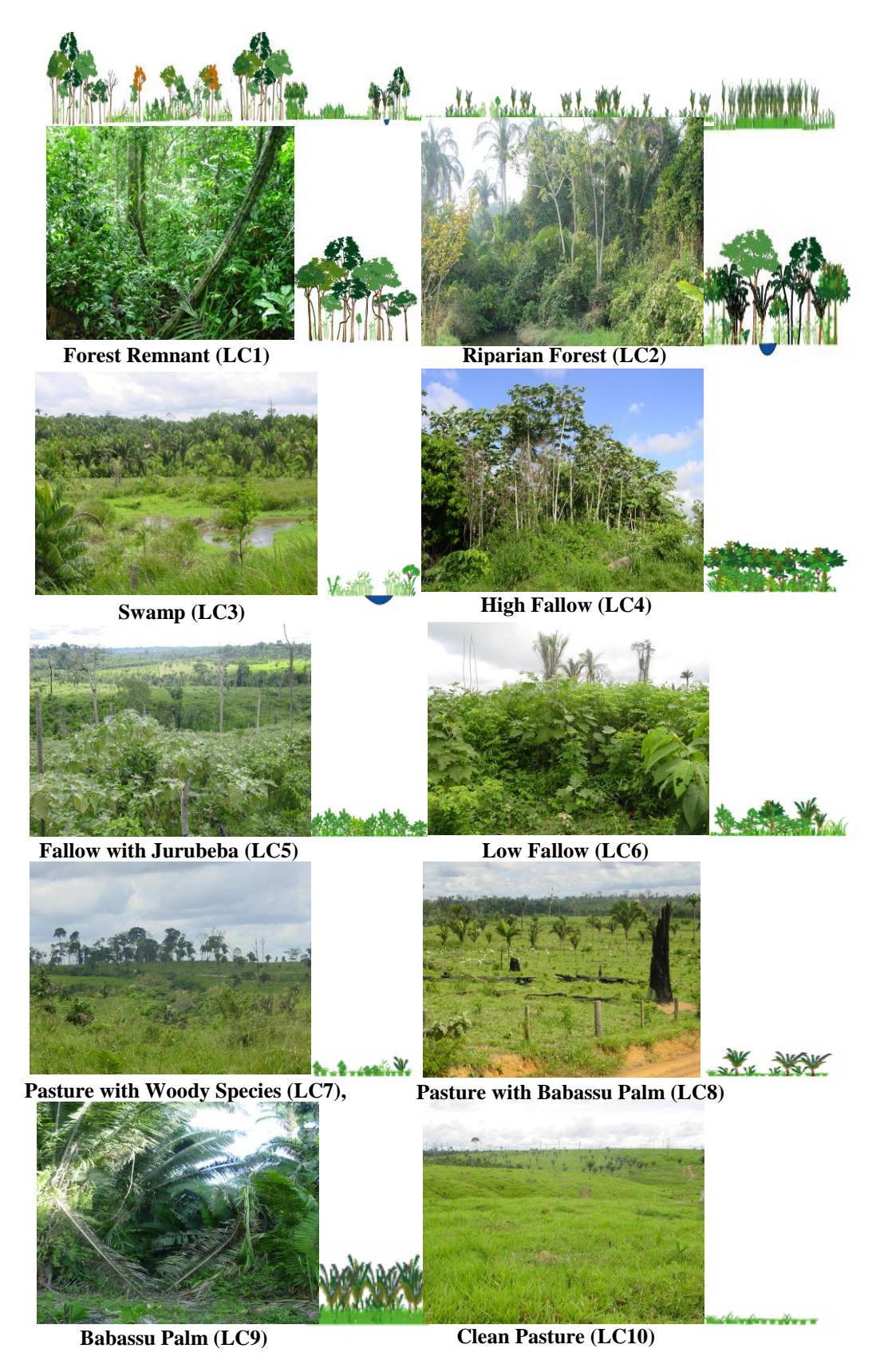
Figure 2. Landscape components of the SP-Benfica, southeastern of Pará State, Itupiranga municipality, Brazil.