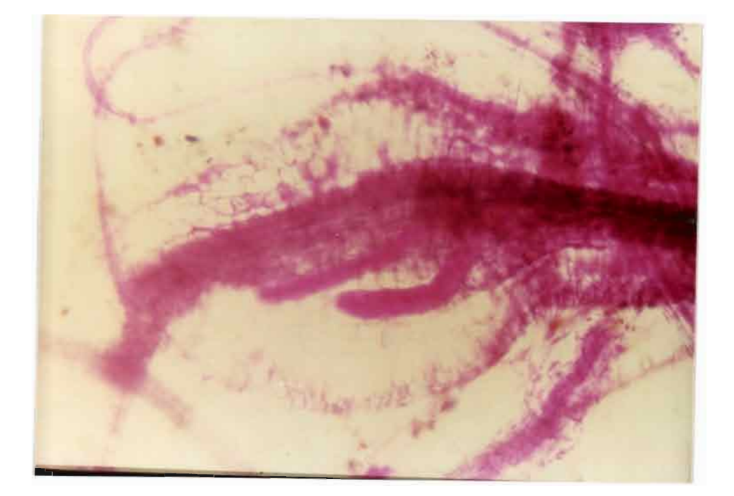
Figure 2: Second-stage juveniles of <u>Meloidogyne</u> spp. initiating gall formation in the root of <u>Panicum maximum</u> cv. C-1, 14 days after inoculation.