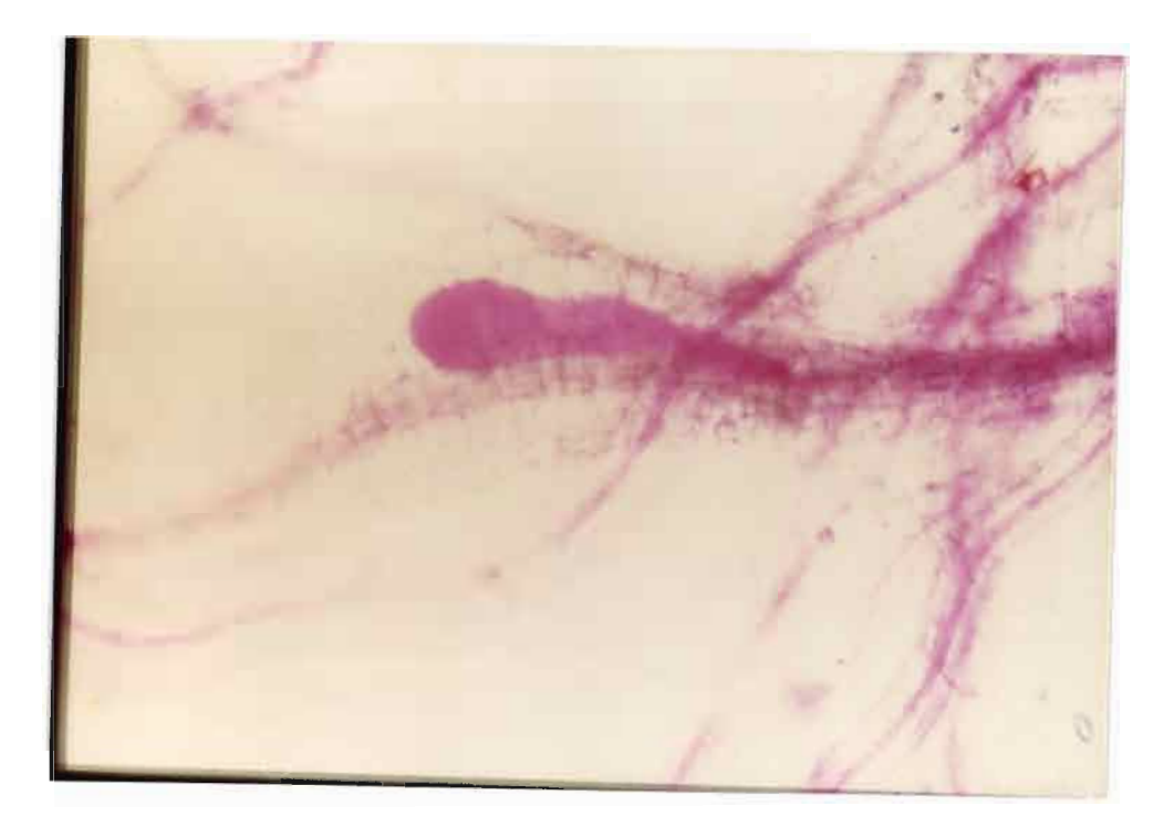
Figure 4: Third-stage juvenile of <u>Meloidogyne</u> spp. in the root of <u>Panicum maximum</u> cv. 2A5, 28 days after inoculation (the most advanced developmental stage observed during the study).