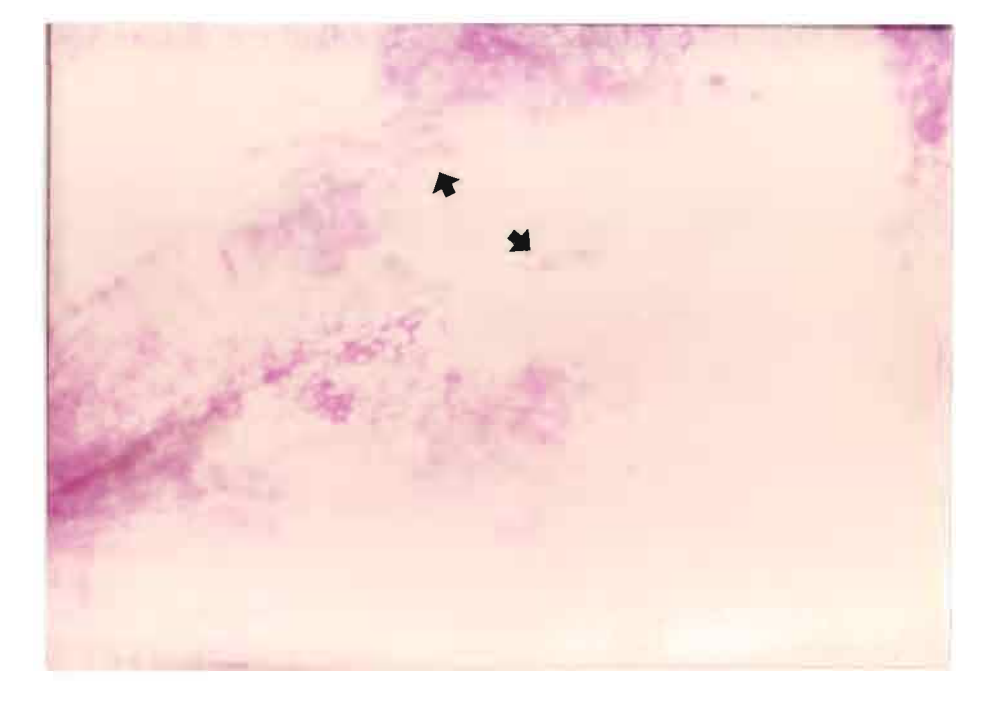
Figure 3: Second-stage juveniles of <u>Meloidogyne</u> spp. in the root of <u>Panicum maximum</u> cv. 2A5, 28 days after inoculation - nematodes probably in an advanced state of lysis.