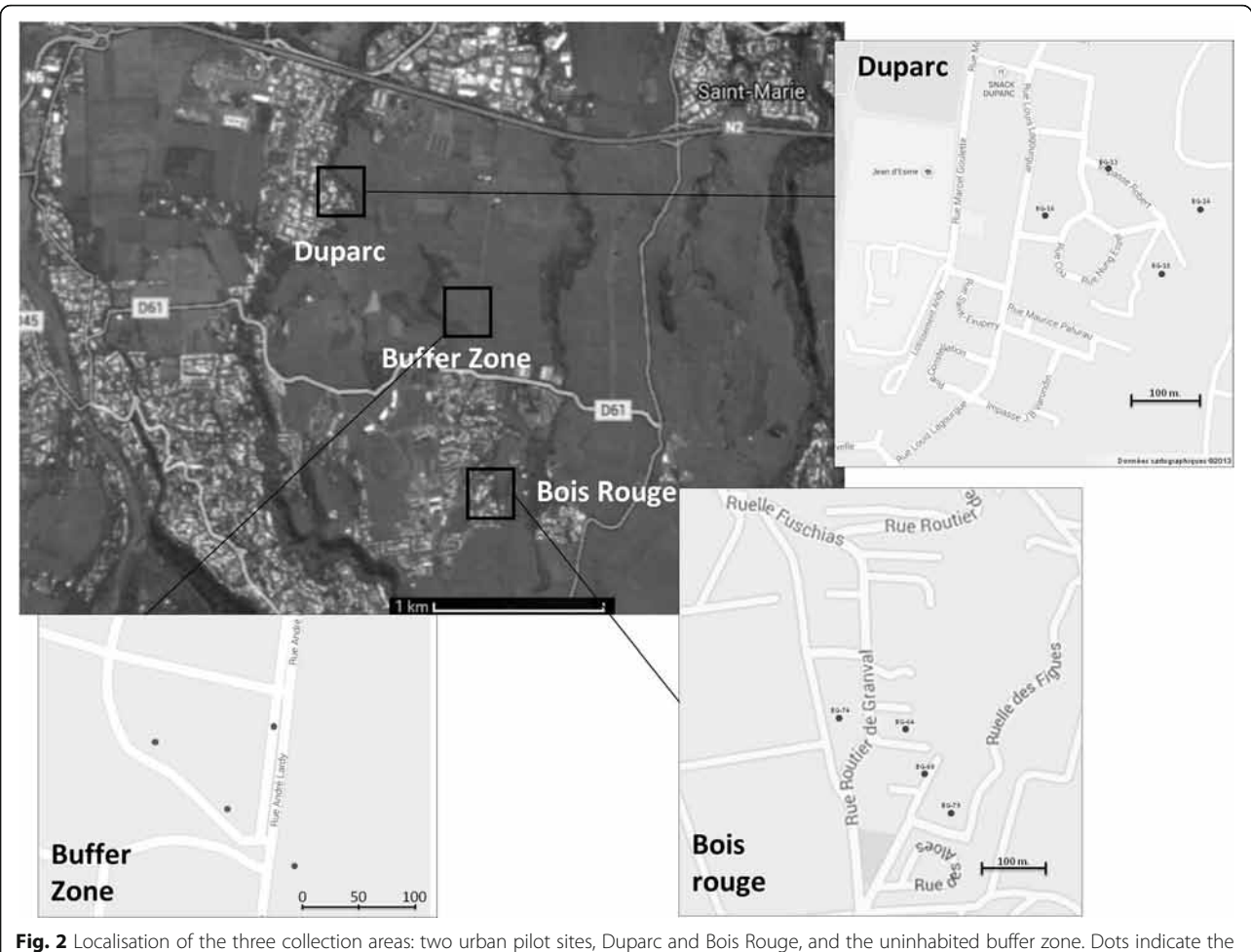
position of the four types of traps at each collection site

here as the theoretical expectation if the same proportion of mosquitoes was caught in each trap (such as a 1:1:1:1 ratio for the type of trap or a 1:1:1 ratio for the 3 weeks of collection or the different collection sites). For the post-hoc test, we determined which categories were significantly different from their null hypothesis by testing each category vs the sum of all categories, with the Bonferroni correction.