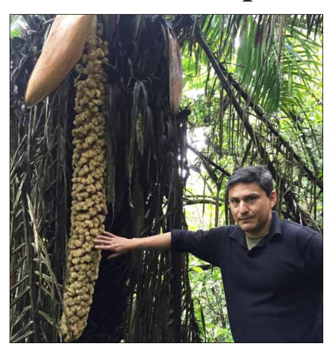
Figure 1. The male inflorescence of endemic ivory palm (Phytelephas aequatorialis). The orange material at the top of the image is the remnants of the bud integument.

We wanted to know whether heat is produced by the flowers and/or by the bud. Heat-producing plants usually warm up at the flowering stage (Seymour and Schultze-Motel 1997), so in February and June 2015, we travelled to