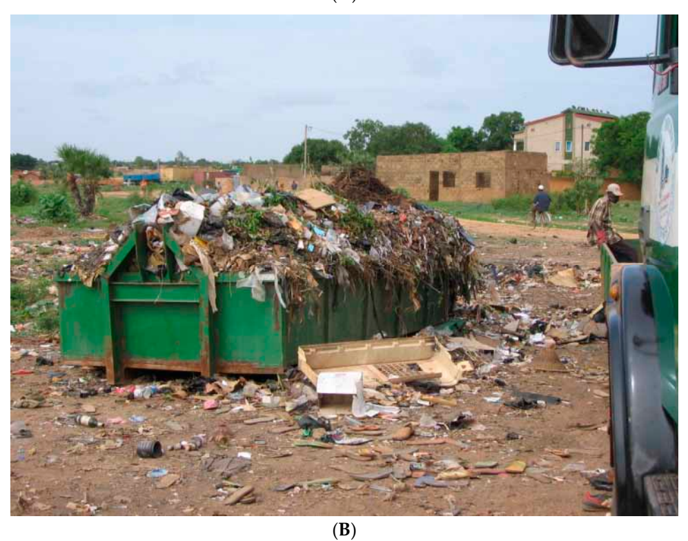
Figure 2. Photographs showing different waste collection modalities. ( A ) Households can start a monthly subscription with an association; here, two women are collecting waste in Gounghin with a donkey car; ( B ) Dumpster full of waste in a street of Gounghin, allowing Aedes mosquitoes to develop during the first rainfall.

On the other hand, the finding that FLAV IgG seroprevalence was not influenced by the type of water supply was unexpected due to the importance of water sources for vector breeding [39].