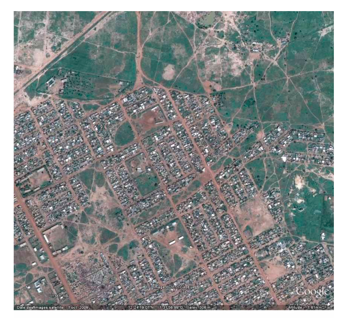
Figure 3. Cont.

Neglected house appearance, which suggests a lack of consideration for the peri-domestic environment, was associated with a higher chance of infection in low, but not in high building density districts, although several studies reported that high building density can support the presence of Ae. aegypti [41,42]. High-rise buildings do not induce the same circulation than low-rise ones. Moreover, the presence of vegetation may also play a role in the vector spatial distribution pattern and consequently in the transmission of the associated flavivirus [43]. This is clearly confirmed by the FLAV IgG variability within the same stratum: high FLAV IgG prevalence was observed in Gounghin (37.3%), but not in Tanghin (19.9%), although both districts belong to the same SLBD stratum. Such differences may be explained by their spatial urbanization structure: house clusters in Gounghin led to higher local building density than in Tanghin where fallow areas are more regularly dispersed (Figure 3). Moreover, municipal garbage dumpsters were installed in Gounghin, but not in Tanghin.