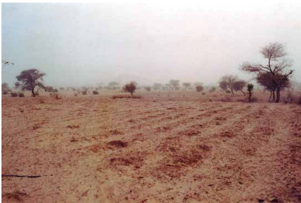
Fig. 4. Field in the Sahel near Chetimari in southwestern Niger during the dry season (13°15'N, 12°28'E).

Literature records: SW Niger (Roman 1974, as Prosymna meleagris : Two specimens); Alambaré, Gaya, La Tapoa (Chirio 2009); Alambaré, Kouré, La Tapoa, Malbaza (in error), Piliki, Tounga Yacouba, Têla (Chirio et al. 2011).