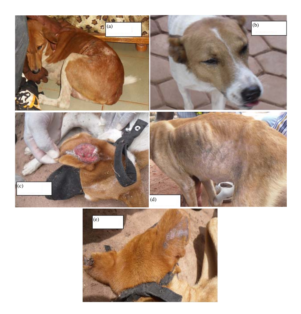
Fig. 2 (a-e): Images of dogs showing different cutaneous lesions and symptoms, (a) Case 1, (b) Case 2, (c) Case 3, (d) Case 4 and (e) Case 5

To confirm the results and to identify the species, PCR analysis was performed on buffy coat samples (all cases) and cutaneous biopsy samples (all cases except Case 1 which did not have open lesions). Biopsy samples were positive for L. infantum in 3 of the seropositive dogs (Case 2, 3 and 4) (Fig. 3). Only one buffy coat sample (Case 3) was positive.